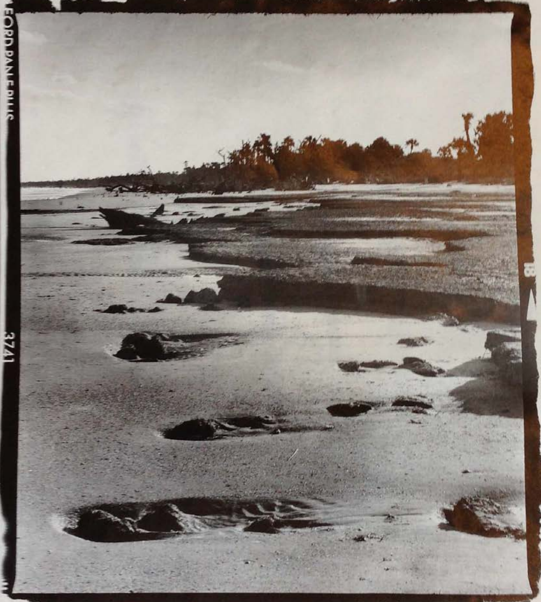
Low tide reveals the imprints of past lives—shards of the island's maritime forest.