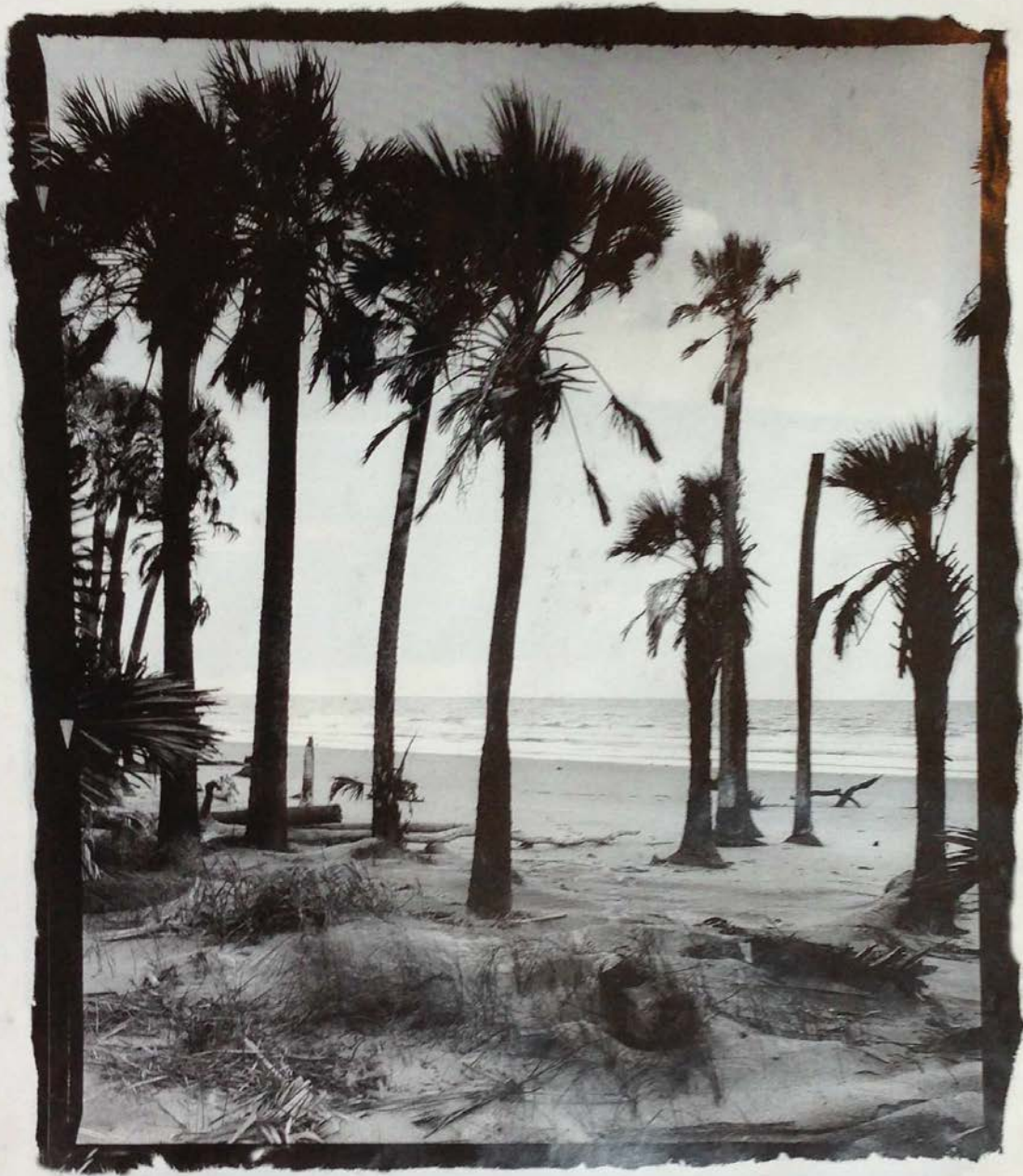
High tide encroaches into the palmettos and reedes, slowly eroding the narrow open beach.