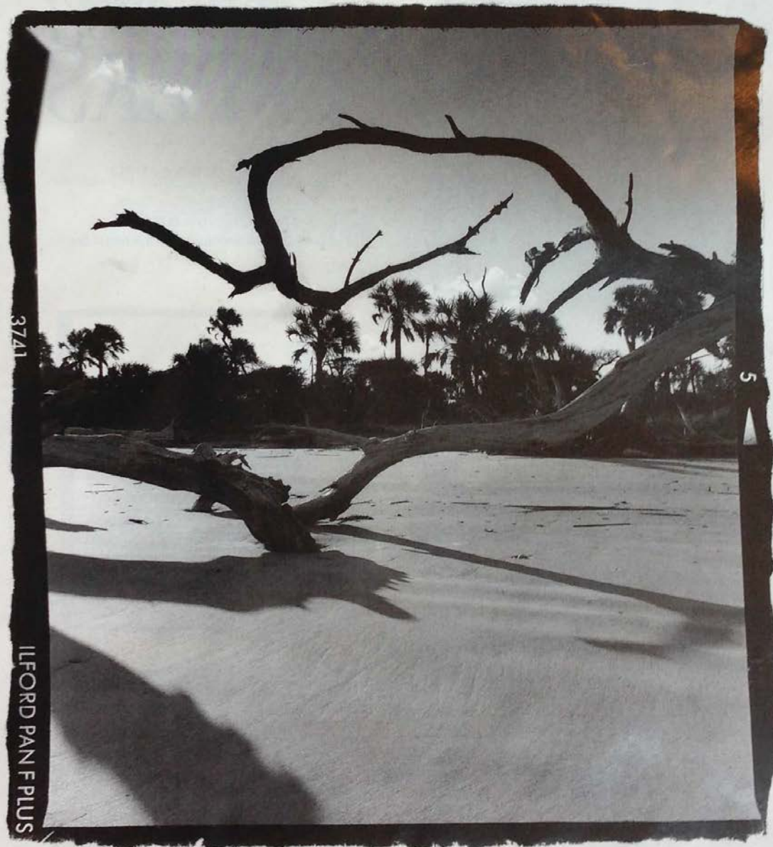
Time stands still on this uninhabited 2,000-acre barrier island, protected by the state's Heritage Trust. Nature alone transforms the landscape, attested by the tangles of fallen trees.