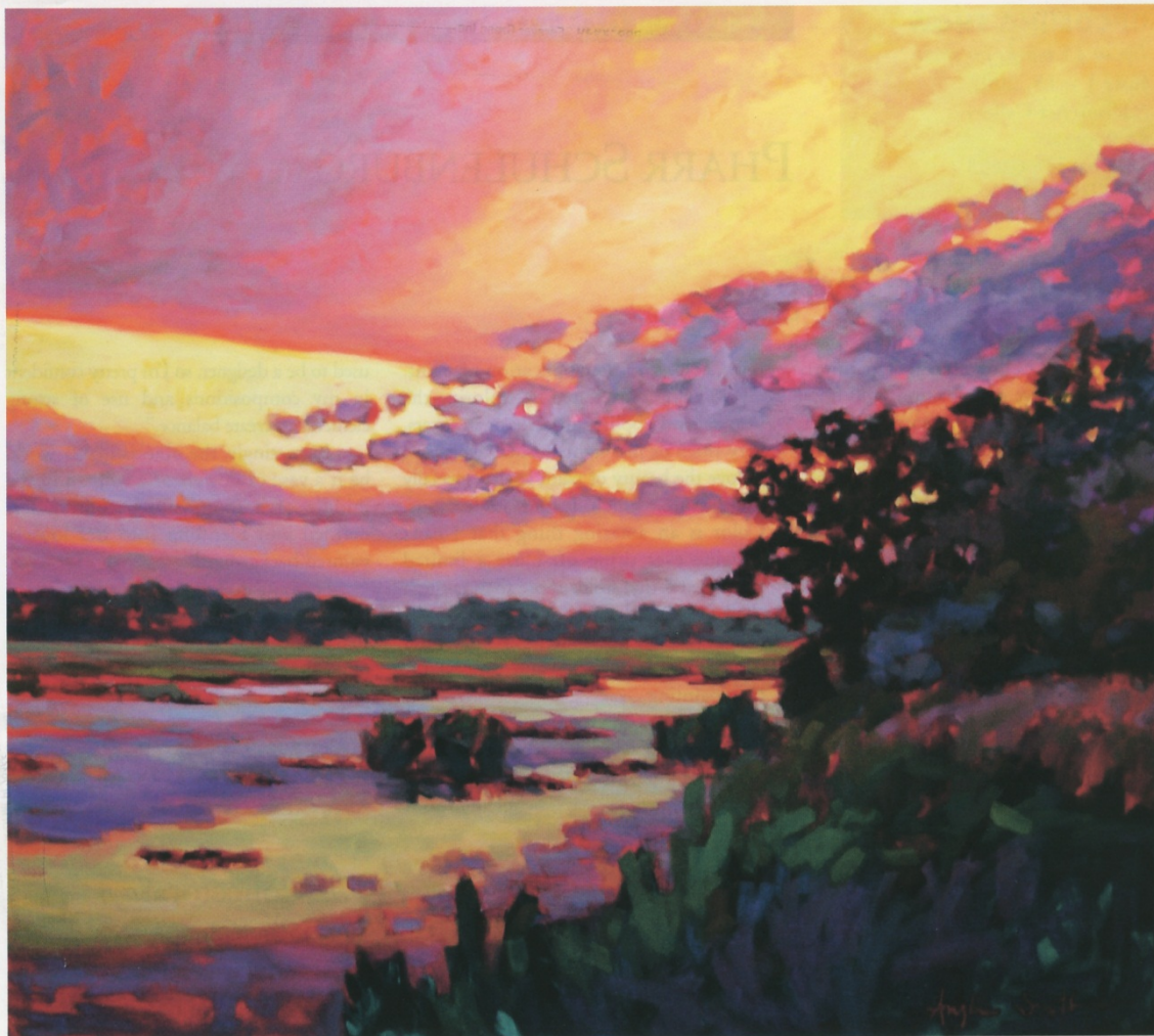
COOL FRONT, OIL ON CANVAS, 48 x 54"

afternoon sun, that although I push the color, I want it to remain convincing. To me, the drama of painting is color." ●